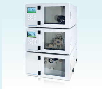
Quality Control Solution